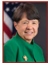
Chair Mary Jo White U.S. Securities and Exchange Commission