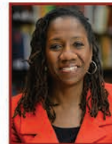
Sherrilyn Ifill NAACP Legal Defense and Educational Fund